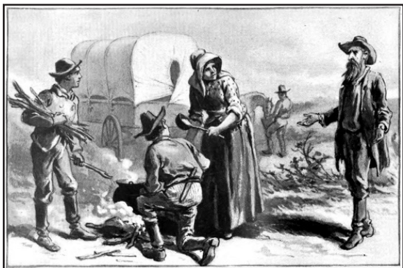
First Appearance of Dionysius